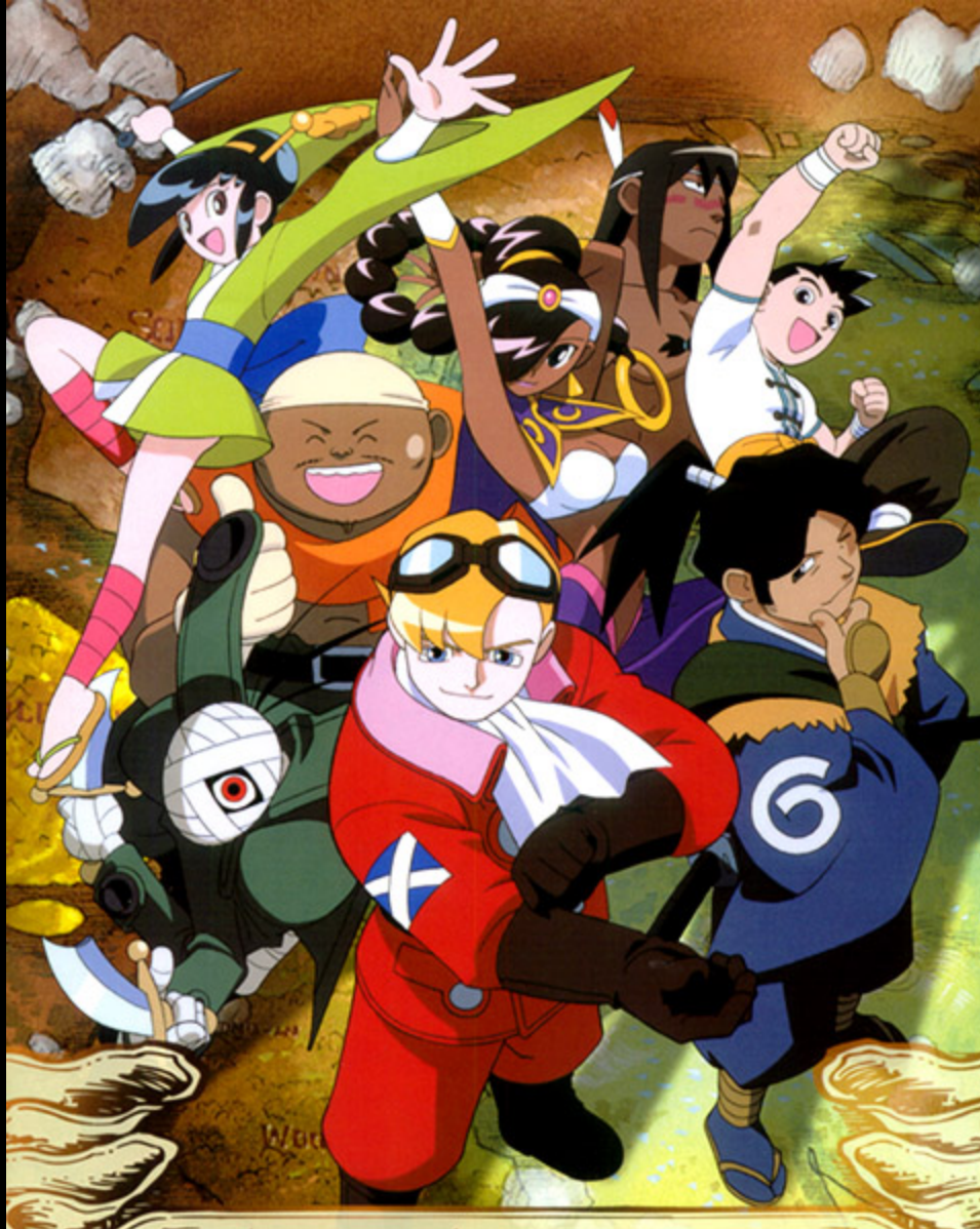
Power Stone Jump (Version 1.2)