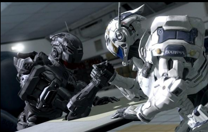
Left: A.R.S Suit of Sam Gideon wrestling prior model Prototype. {not canonical}