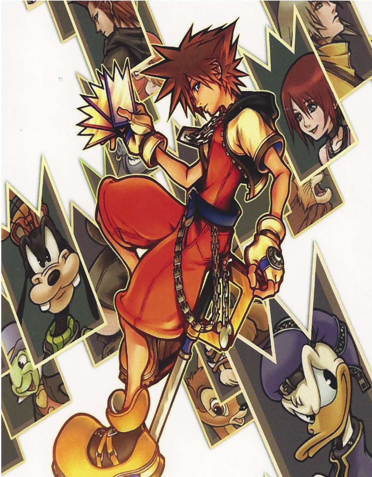
Kingdom Hearts – Jumpchain of Memories By Bigmun