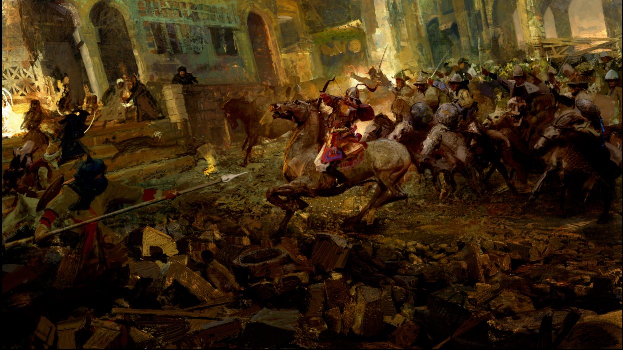
Official game art

You may use this jump as a supplement to other jumps that have similar medieval/fantasy themes. Viable settings must have “cold metal” designs such as spears, swords, bows and whatnot as a regular or common theme of the setting.