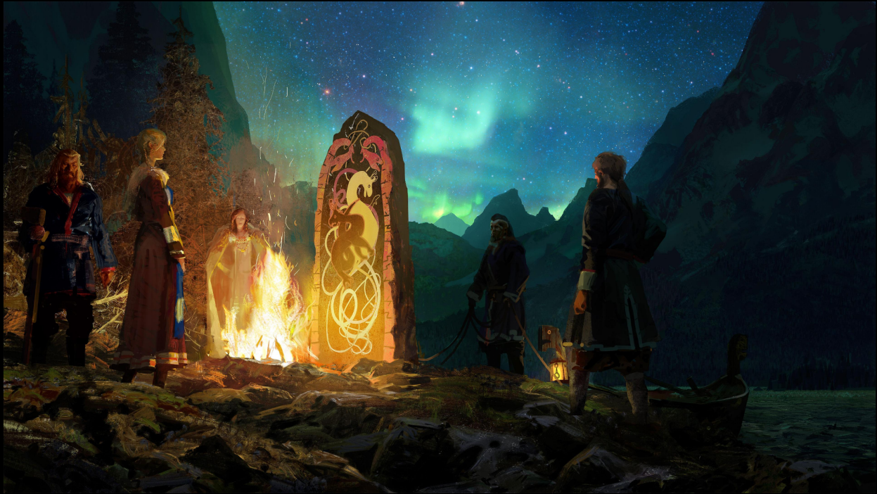
Official game art

You can import any Companion to the jump at the cost of 50 CP each. Four Companions cost 100 CP, and eight Companions will cost 200 CP.