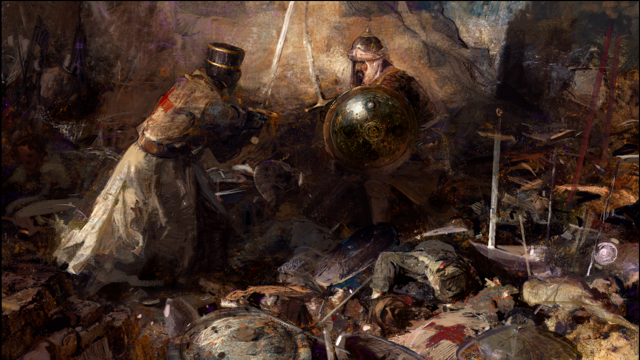
Official game art

You get to create your own religion for free and you may come up with any name for your religion. Alternatively, you may choose any existing religion and give boons to that instead. You could even retcon that existing religion into something else entirely.