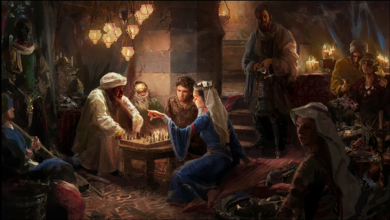
Official game art

Discounted items are 50% off for their respective origins. Discounted 100 CP items are free.