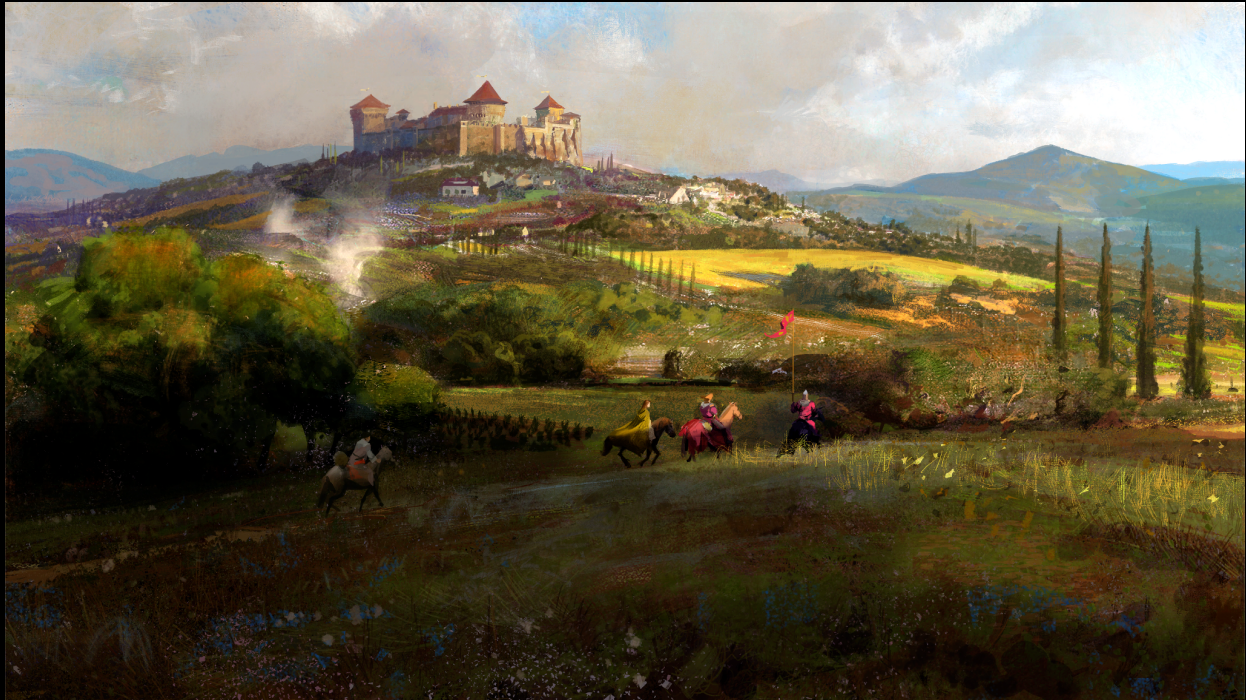
Official game art