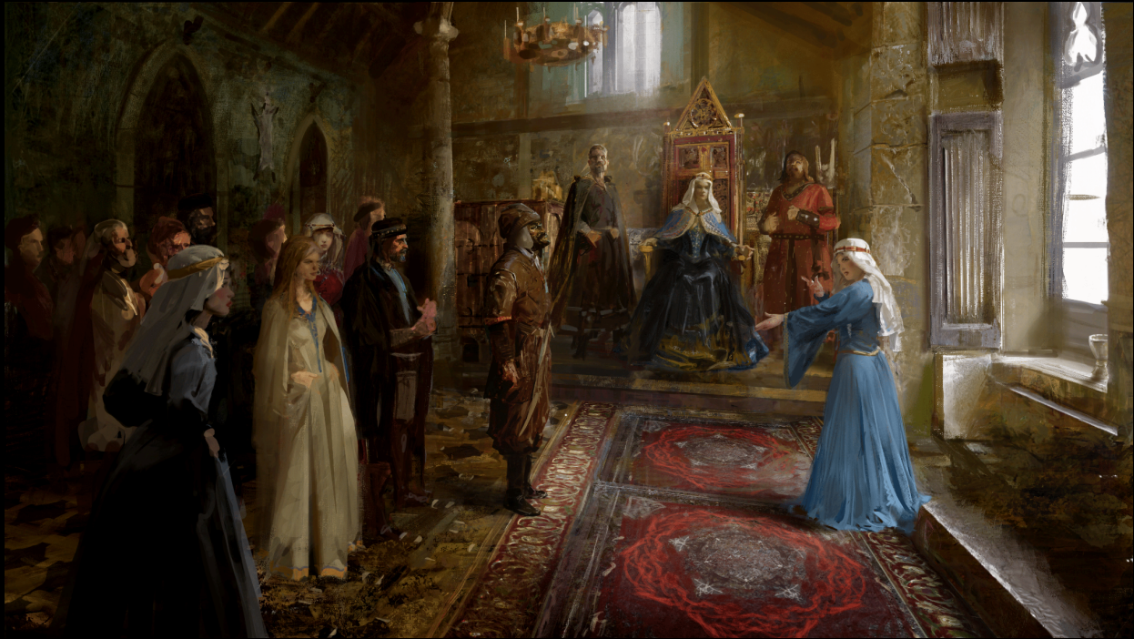
Official game art

Discounted perks are 50% off for their respective origin. Up to four discounted 100 CP perks are free. The other discounted 100 CP perks cost 50 CP.