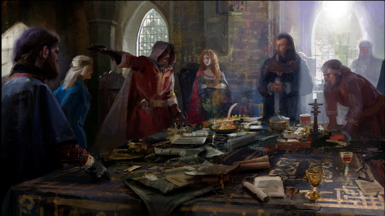
Official game art

Every single perk under the Organization category is related to your organization . You may freely choose who is affected by these perks.