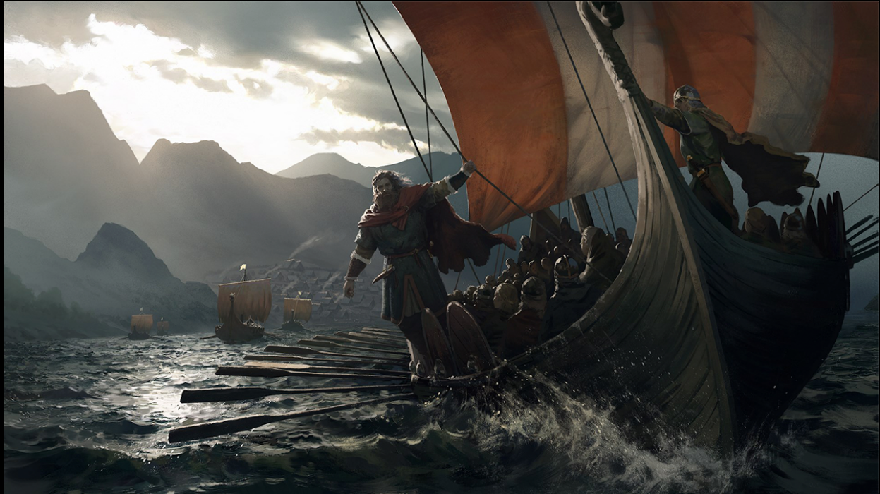
Official game art