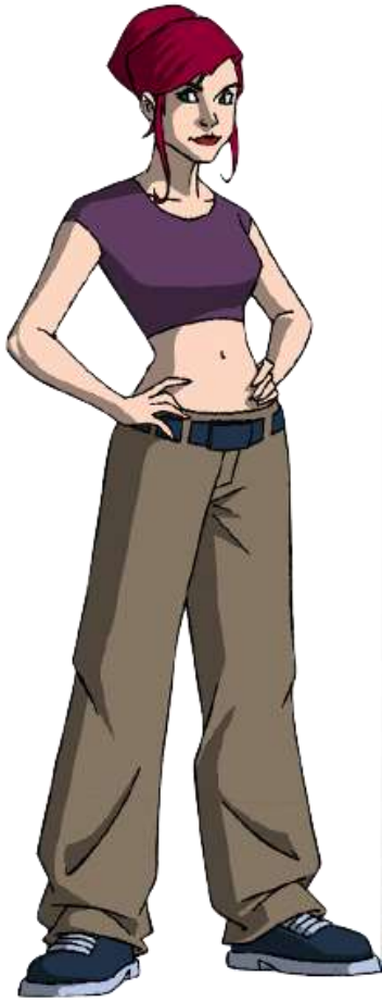
April O'Neil (100 TP): Smart, mature, and long-suffering tech genius and secret keeper of the Turtles