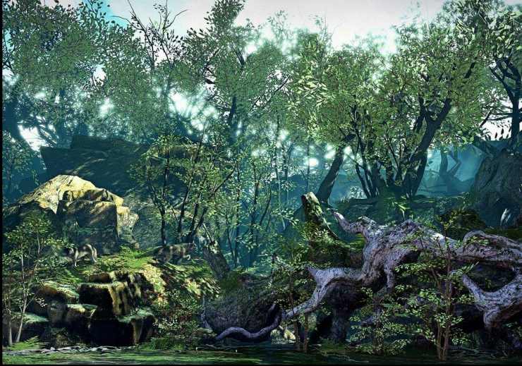
1. Silver Wolves' Haven

This world is home to a variety of different locations. Some will be rather familiar while others are quite unique. The vast majority will be safe locales, but others can be very, very dangerous for a multitude of reasons. As a special bonus, trouble shall not find you in this world for the first 24 hours of your time here. No matter the drawbacks you have taken, you have a guarantee of safety so long as you do not seek danger. You may decide where you wish to be dropped off in this world. However, if you roll a 1d10 and instead rely on fate for your location, you will receive 50 CP as a bonus.