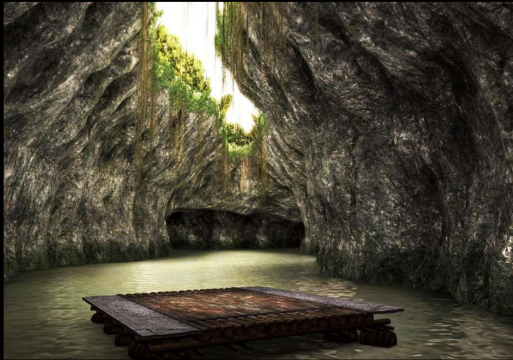
9. Mt. Fuji – Hidden Dragon

You've found yourself on a raft floating through an underground cavern found deep below Mt. Fuji. Called the Hidden Dragon out of reverence, these veins of caverns run below the entirety of Japan.