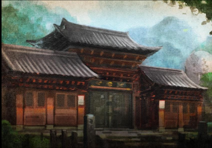
5. Ling-Sheng Su

A world-renowned temple for martial arts found in the mountains of China, one willing to take on new students. Despite all the famed warriors who once called this place their home, none know when the temple was created or who created it.