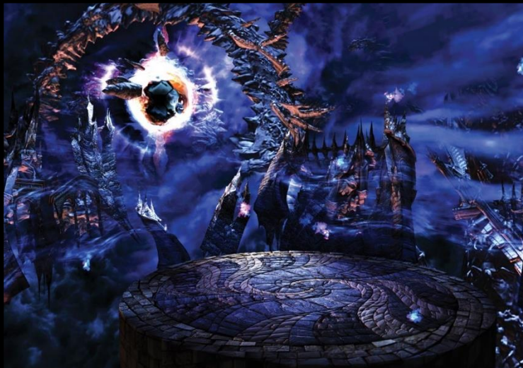
10. Astral Chaos

Perhaps you could be able to take advantage of that little fact, if you were willing to take a few risks. Some secrets are not always helpful after all.