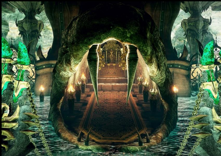
6. Kunpaetku Temple – Serpentine Banquet

For now, the only hints of the temple's origins lie in the three sacred treasures the temple guards and the unique spiritual training techniques taught here.