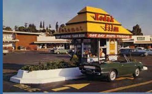
Photo Hut (200 CP) - Your very own place of business for all things camera. You own this property and all paperwork is made out in your name, with any business related expenses paid for you each month by fiat. Comes with an NPC to run things for when you aren't there. No one will ever question this. You can decide where this gets placed at the beginning of each Jump.

Old Barn (400 CP) - How long has all this stuff been sitting here? You now have a beaten up old barn attached to any property you own or your Personal Reality/Warehouse. It is filled mostly with junk, but there are some genuine treasures in there if you take the time to look. These treasures change based on your setting and will not be anything legendary, but they will always be something that makes you sit up and go 'whoa.' The treasures restock at the beginning of each Jump.