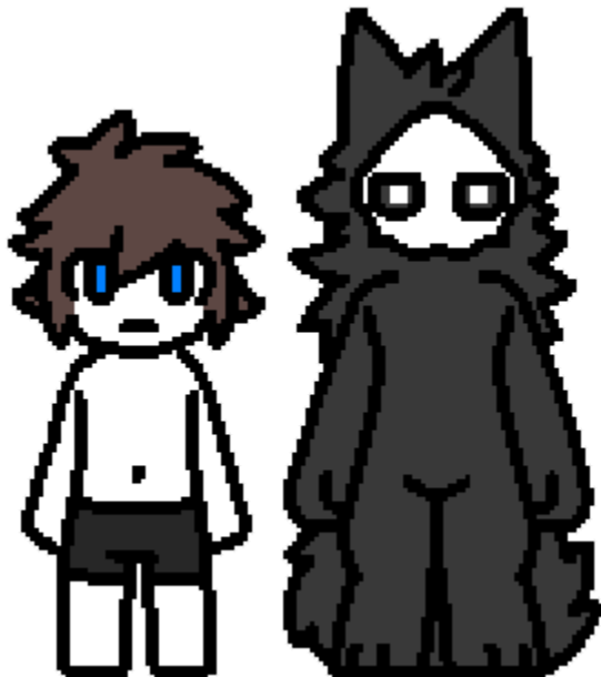
Colin & Puro [100] - The Human and the Exiled

New Test Subjects [100/800] - You may choose to import any one companion of yours into the facility for the duration of the jump. You may also import all companions for the cost of 800 additional CP.