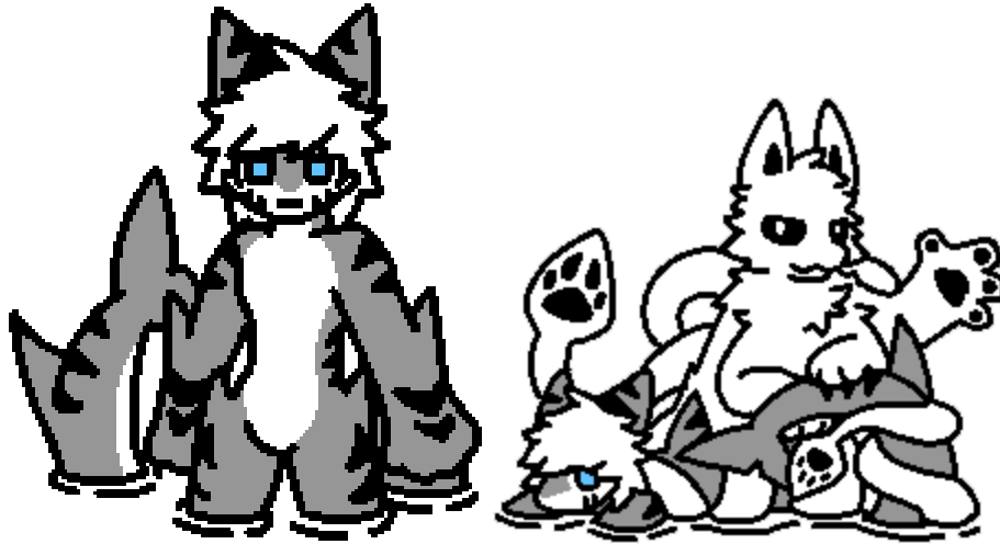
Tiger Shark & Squid

Dog [900] - The two most notable and developed of their respective types of variegated latex in the Aquatic Area, Tiger Shark and Squid Dog can be viewed in many ways as parallels to the human-latex pair of Colin & Puro - Tiger Shark yearning for companionship to the point of wanting to transfur Lin by any means necessary and Squid Dog being the result of an impromptu encounter that ends with the companion-seeking Shark getting wrapped up in his tentacles. Both also seem to command the respect and loyalty of their respective kind, with Tiger Shark being able to command his fellow latex sharks to rush at any interlopers and a large number of squid pups maneuvering to assist Squid Dog in any way they can.