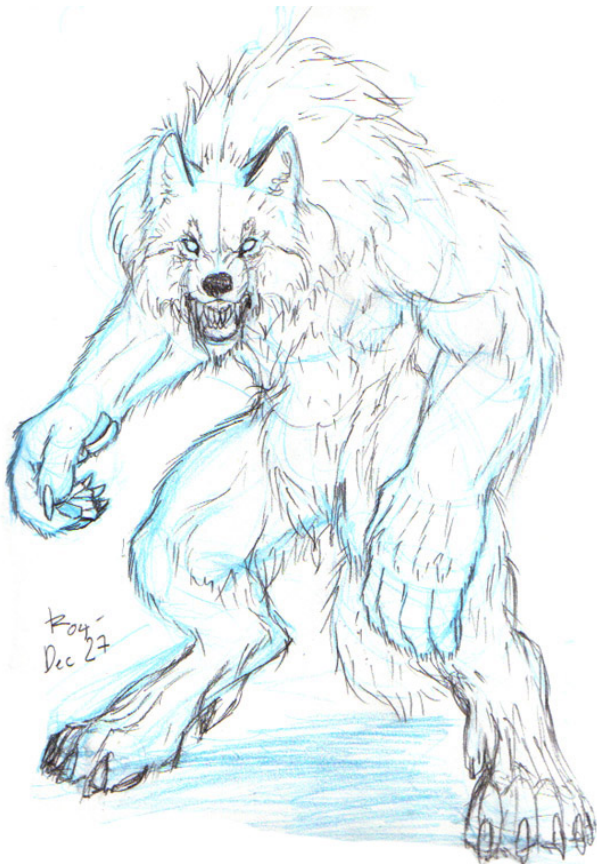
Bipedal Locomotion [Free / 100 WP]