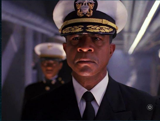
Commodore Glen Ross, commander of the U.S.S. Saratoga

Jumper, I am Commodore Glen Ross, commander of the U.S.S. Saratoga. I need you to understand what you're walking into. It's 2063, and in a few weeks, the Chigs, alien sons of bitches we didn't even know existed, are gonna hit us like a goddamn asteroid. The Human-Chig War is about to ignite, and you're stepping into the fire with ten years to prove you belong. Starting today, you've got options: join the USMC 58th Squadron, the Wildcards, as their newest hotshot pilot; take a post as a Navy CIC officer right here on my bridge, plotting the moves that keep us alive; or play the corporate game as an Aero-Tech Executive, wheeling and dealing with secrets that could make or break us.