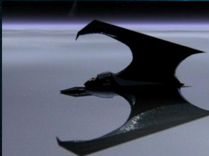
Chiggy von Richthofen in action

You're in for a nightmare with this 300 CP drawback, Butts is a walking disaster, and you're tied to his suicide missions for the worst of the war. 58th Pilots, you're flying into Chig kill-zones because Butts thinks he's invincible, with your squad taking the heat for his stunts; CIC Officers, you're forced to orchestrate his insane strategies, risking the Saratoga when his plans go south; Aero-Tech Execs, you're draining your budget and reputation to supply his endless demands, with every failure pinned on you. His loose-cannon attitude guarantees casualties and chaos, leaving you to pick up the pieces while fighting to stay alive. Prove you can handle this lunatic, or you'll both be space dust.