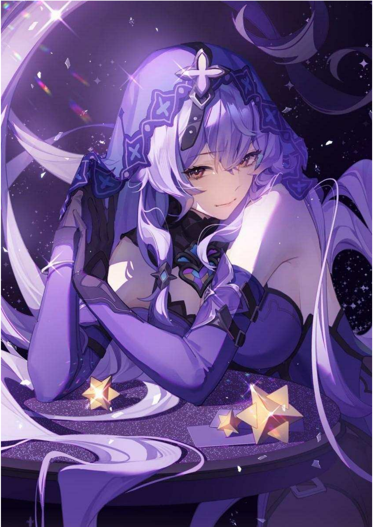
18. Callum Lynch