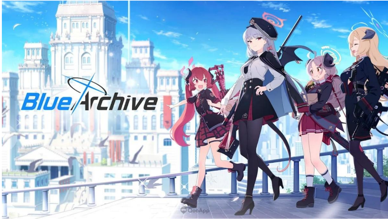
Jump by Blue