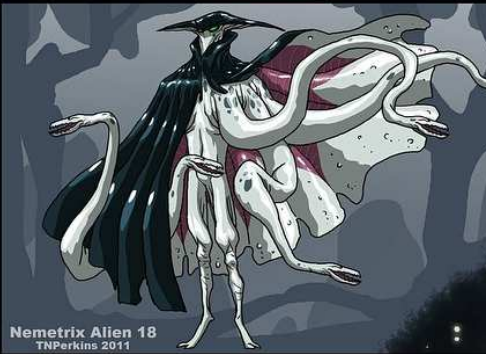
Nemetrix Alien 18 TNPerkins 2011