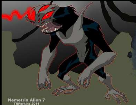
Nemetrix Alien 7 TNPerkins 2011