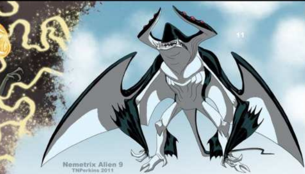
Nemetrix Alien 9 TNPerkins 2011