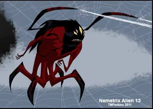
Nemetrix Alien 13 TNPerkins 2011