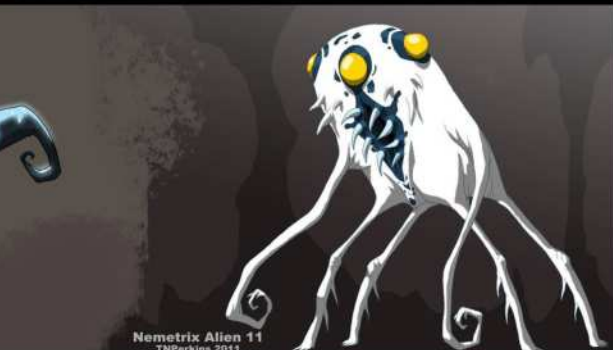
Nemetrix Alien 11 TNPerkins 2011