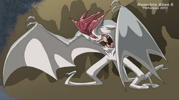
Nemetrix Alien 6 TNPerkins 2011