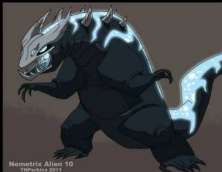
Nemetrix Alien 10 TNPerkins 2011