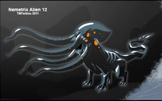
Nemetrix Alien 12 TNPerkins 2011