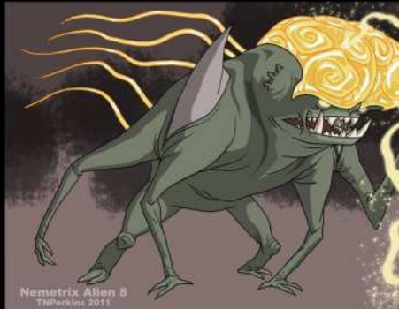
Nemetrix Alien 8 TNPerkins 2011