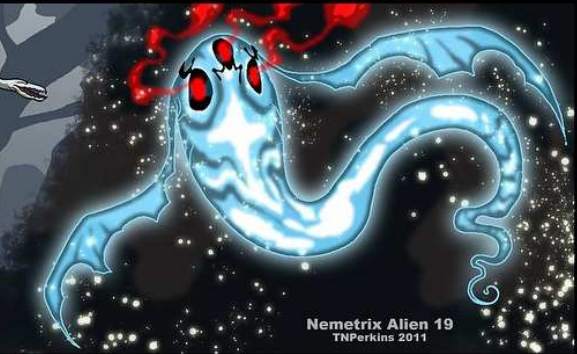
Nemetrix Alien 19 TNPerkins 2011