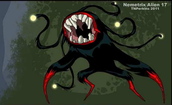
Nemetrix Alien 17 TNPerkins 2011