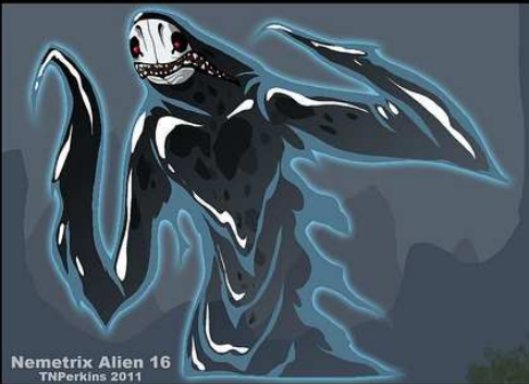
Nemetrix Alien 16 TNPerkins 2011