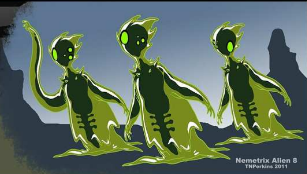
Nemetrix Alien 8 TNPerkins 2011