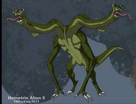
Nemetrix Alien 5 TNPerkins 2011