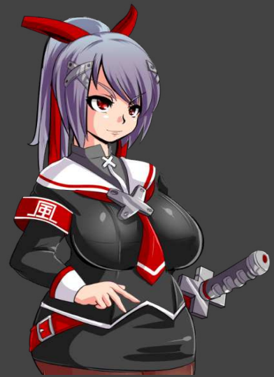
Senka of Teikoku.

Roughing Them Up [100 GP]: And you thought only the BadGuys had fun. Well, as a member of the Kamikaze Kommittee, you can shake down unrighteous individuals for cash. Heck, roughing up thugs for their lunch money is actually fairly ironic and totally acceptable to the public now. You could do it in full daylight and in front of the Police without incident. Of course, you probably need to first beat the thugs up.