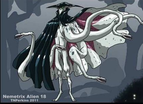
Nemetrix Alien 18 TNPerkins 2011