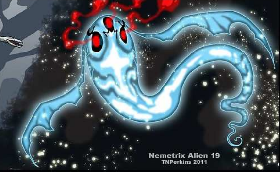
Nemetrix Alien 19 TNPerkins 2011