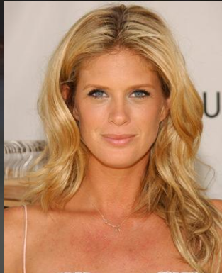
Stacy's Mom (Free!)