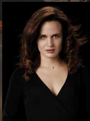
Esme Cullen (Free!)