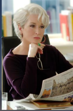
Miranda Priestly (Free!)