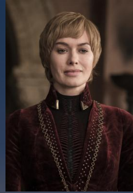
Cersei Lannister (Free!)