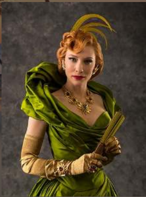
Lady Tremaine (Free!)