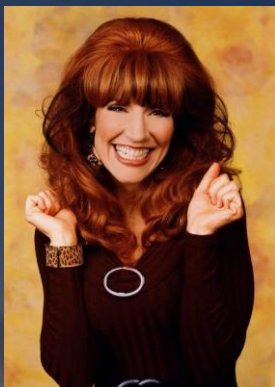
Peggy Bundy (Free!)