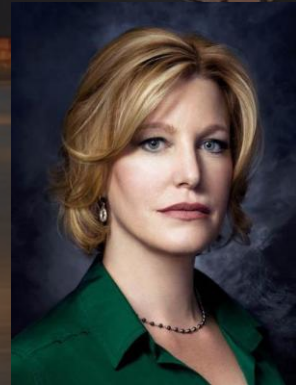
Skyler White (Free!)