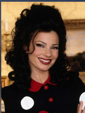
Fran Fine (Free!)