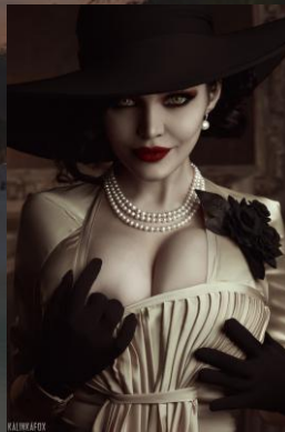
Lady Dimitrescu (Free!)