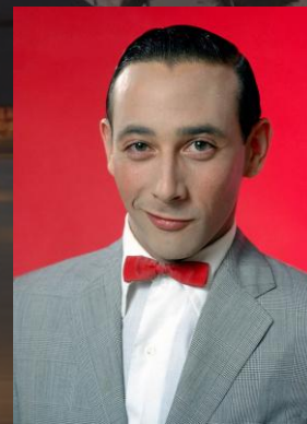
Pee Wee Herman (Free!)