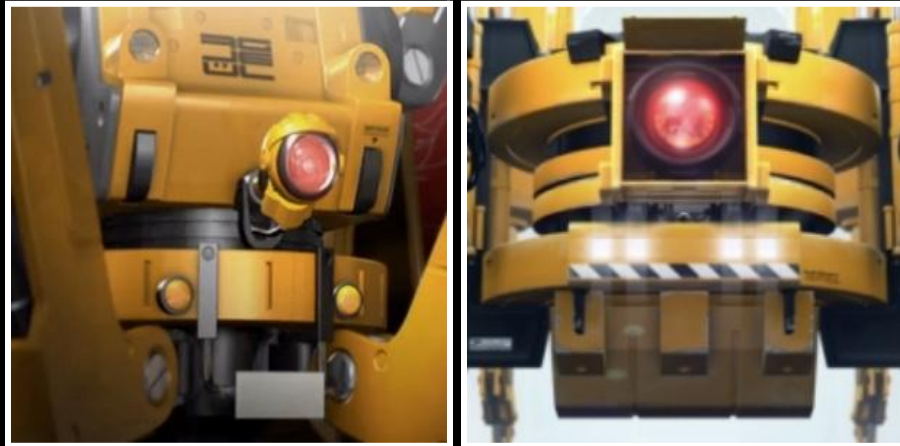
(Pictured: Tauri 34 [Left] & Tauri 32 [Right])