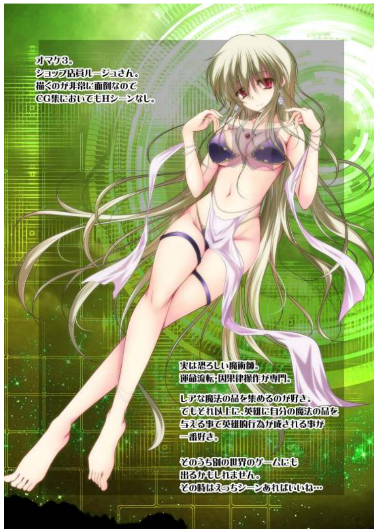
Madame Rouge Occult Shop Keeper

If you have the “ Got to Pay the Way ” Drawback, the debt collectors consider this location your collateral for the jump. You cannot lose the shop, but paying for maintenance becomes a bit more than profits can manage. Extra space is added to the basement level for this drawback, though — a sex dungeon. There, you may sell your services on either side of the BDSM spectrum to help pay off your debts. After the jump, the sex dungeon may be toggled at will on a jump by jump basis.