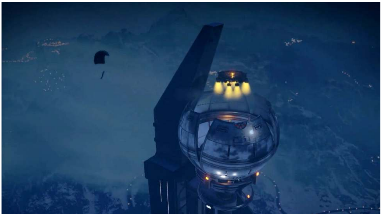
Project Illapa control core lifting off from its berth

- Project Illapa's Best (400CP) : Project Illapa has been in some form of development or another for the past 30+ years. Even now, it's not the best it could be. But this options grants you the ultimate version of Illapa, even beyond where it normally could have gone. This is a mobile core that can fly, is an unmanned drone, and is a circular platform with undermounted hover engines that is about the length of a main battle tank. More importantly, it is capable of controlling the weather in an entire country, and can cause and prevent any weather of any type, in any location, and in any combination. Want a blizzard in a tropical swamp, or a tornado in a swamp? With this you can. Lastly, while the core is difficult to detect, if it is ever destroyed, you can find it in your warehouse repaired to full readiness after a week. And a certain Agency would likely reward you handsomely for this technology. Don't worry, even if you "give" it to them, you'll get it back at the end of this Jump.