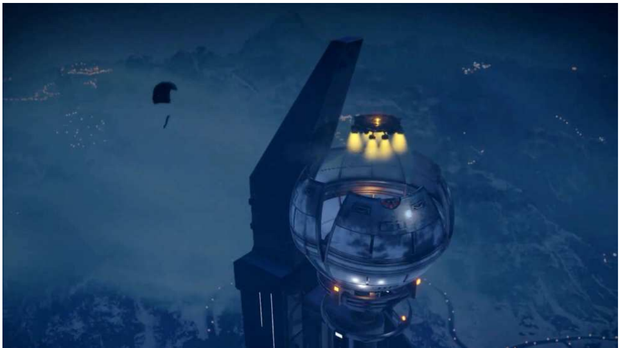
Project Illapa control core lifting off from its berth

- Project Illapa's Best (400CP) : Project Illapa has been in some form of development or another for the past 30+ years. Even now, it's not the best it could be. But this options grants you the ultimate version of Illapa, even beyond where it normally could have gone. This is a mobile core that can fly, is an unmanned drone, and is a circular platform with undermounted hover engines that is about the length of a main battle tank. More importantly, it is capable of controlling the weather in an entire country, and can cause and prevent any weather of any type, in any location, and in any combination. Want a blizzard in a tropical swamp, or a tornado in a swamp? With this you can. Lastly, while the core is difficult to detect, if it is ever destroyed, you can find it in your warehouse repaired to full readiness after a week. And a certain Agency would likely reward you handsomely for this technology. Don't worry, even if you "give" it to them, you'll get it back at the end of this Jump.