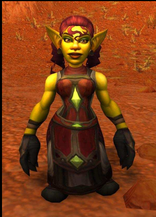
Soridormi, The Bronze Consort [100 DT]

Babycrazy in many senses of the word, we can thank (or curse) her for Wrathion's birth. While in "Canon" she would meet her demise at the hands of Deathwing, with this you've managed to avert her death and inadvertently gained her interest, once more in many senses of the word. She will dedicate her life to healing any injuries you and yours may have as well as ensuring you have as many offspring as possible, even offering herself for the task if you are so inclined. She is rather intense, but her heart is in the right place.