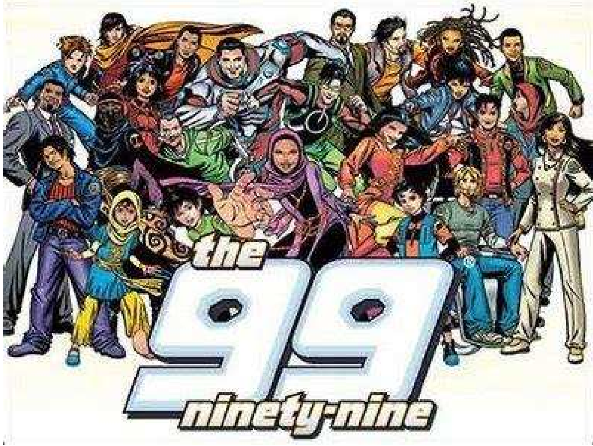
Comic Book by Naif Al Mutawa, Jump by Aehriman

It is said that all the darkness of the world could be shattered by the light in just one pure heart.