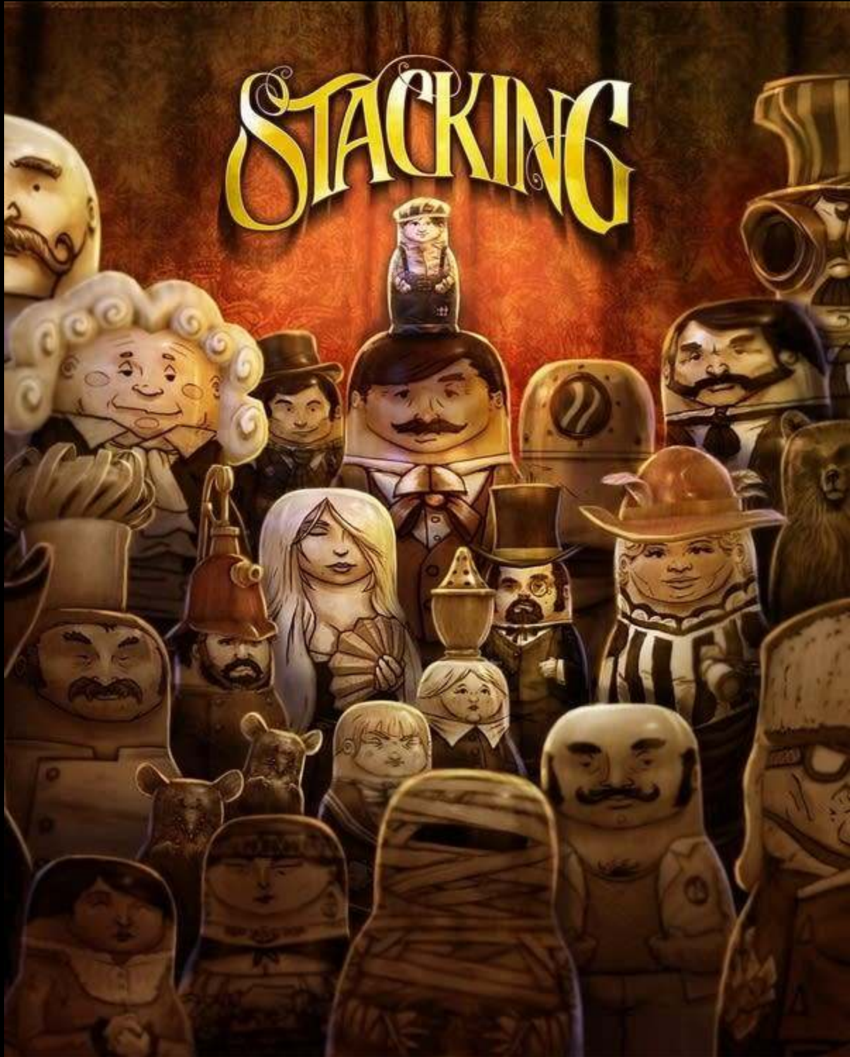
Stacking Jump Version 2.0 (Lost Hobo King Edition) By Tri-Seven