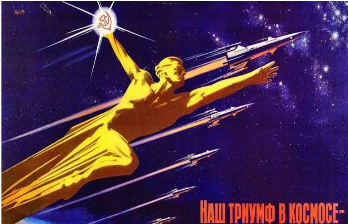
The Reign In The North:

Technocracy in Russia and start the Space Age earlier. Your rewards will be the AI by the name of Sofya and a perk called Time, Faster! which increases the speed of the implementation of your breakthroughs in science, gone are the days of people doubting your work.