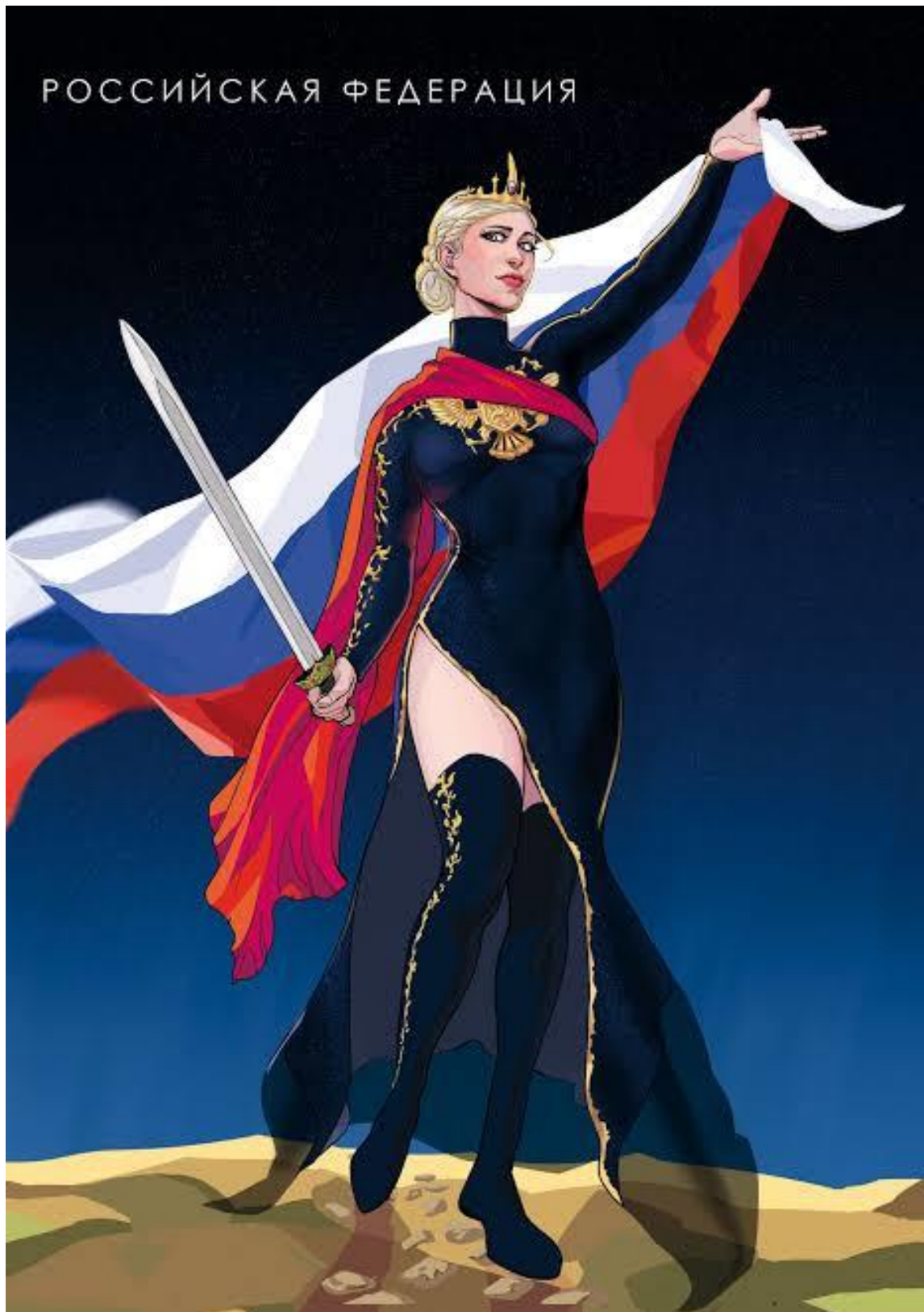
Ukrainian Black Army Victory:

The state is the most criminal and vile institution ever to befall humanity. No other organization is as responsible for wars, famine and death as all the states. In 1918 a group of peasants and workers under Nestor Makhno created an insurgent army in Ukraine, popularly known as the Black Army, this group of insurgents wished to create a stateless