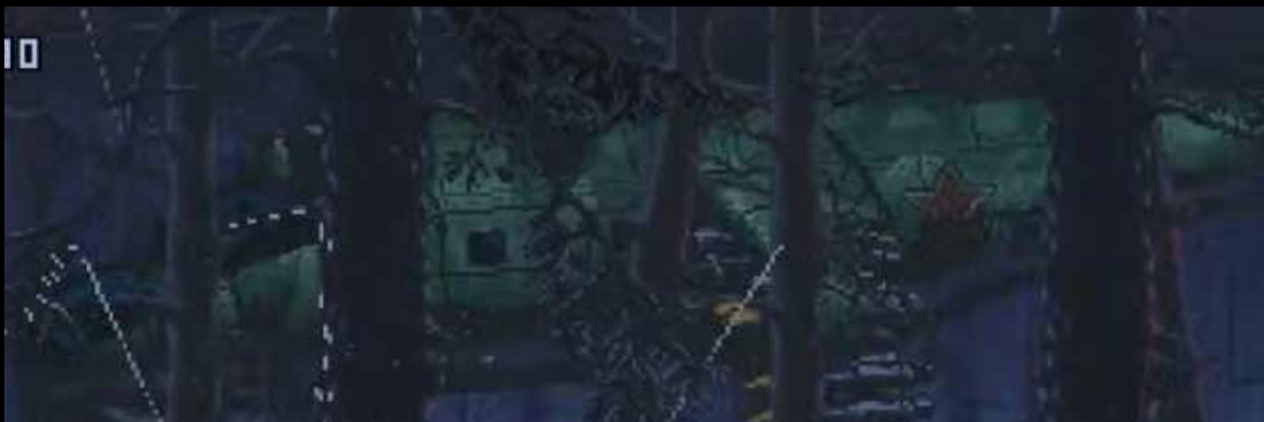
MI-24 Helicopter Gunship