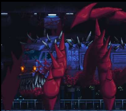
Big Rig Carnarach, the "Scorpioch Macrobutus"