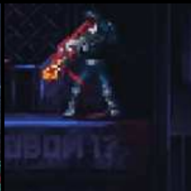
Meatified Turret, Indoskeleton, Turretface(ECIF Soldier With Gun Fused Into Head)