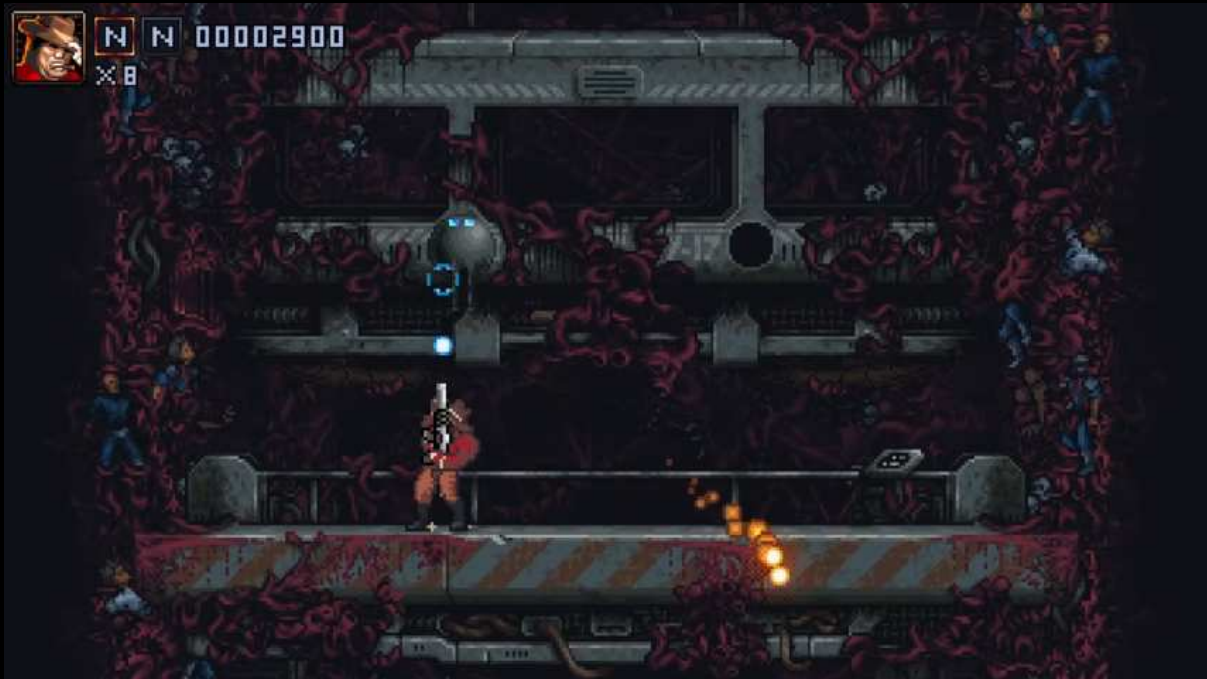
General Meat Moss