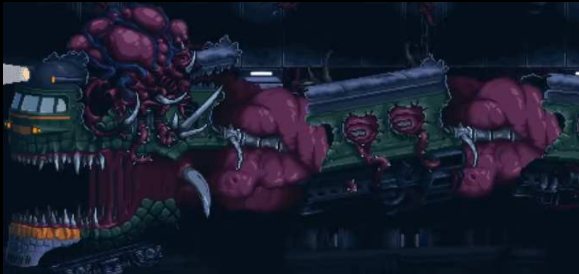
Carrionvoy, the "Iron Serpent"