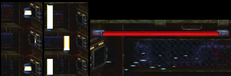
Plasma Laser Grid 1 Collapsed, Plasma Laser Grid 1 Expanded, Plasma Laser Grid 2