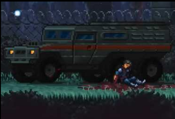
Grind Vehicle Base Transport Model