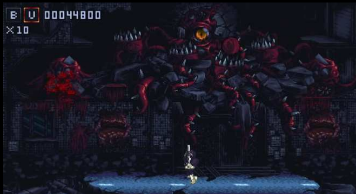
Monster House, the "Structural Biohazard Overgrowth"