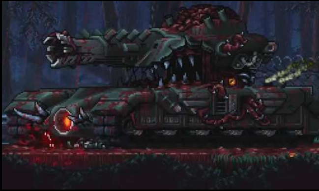
Entrail Blazer MKII, the "Bio Armament Neo-Thalamus"