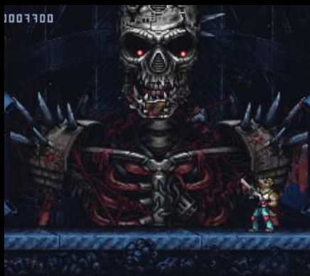
Iron Meat, the "Interdimensional Horror"