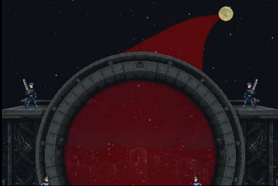
Institute Of Teleportation Gate Activated By Meat Prophet Yuri On The Moon