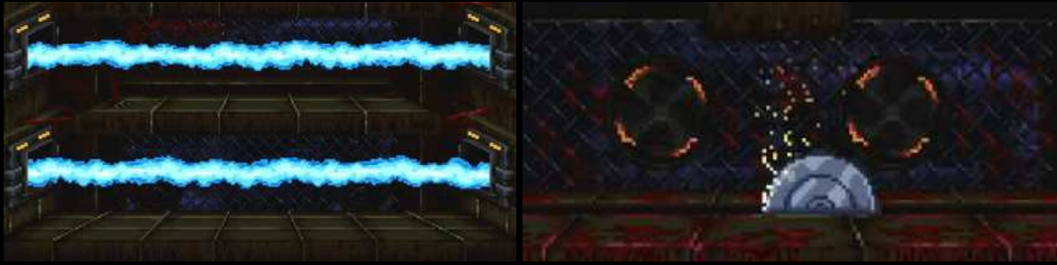
Plasma Beam Trap, Sawblade Trap