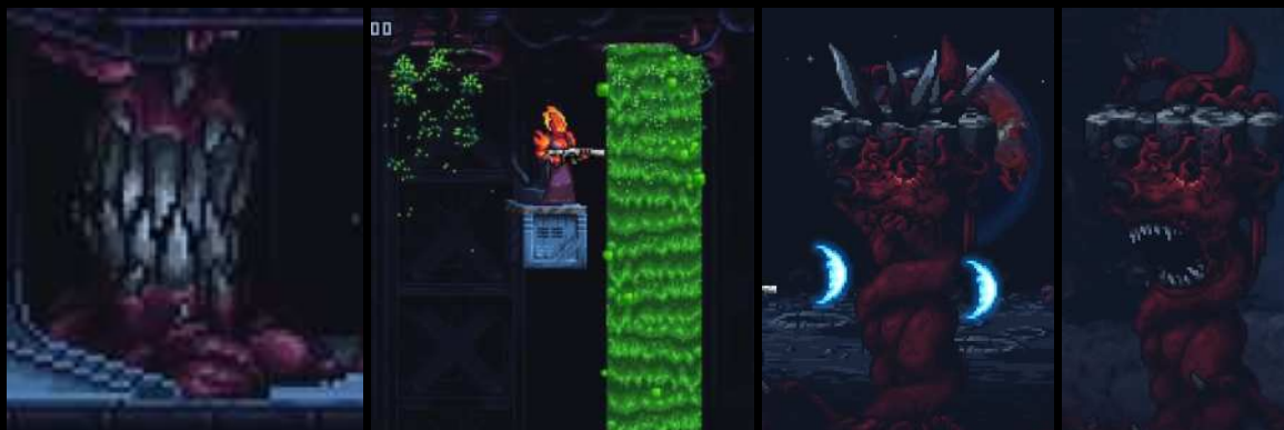
Incisor Trap, Acid Spewer, Moving Meat Pillar With Spikes, Moving Meat Pillar With Maw Turret