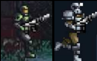
ECIF Grunt, ECIF Spec Ops