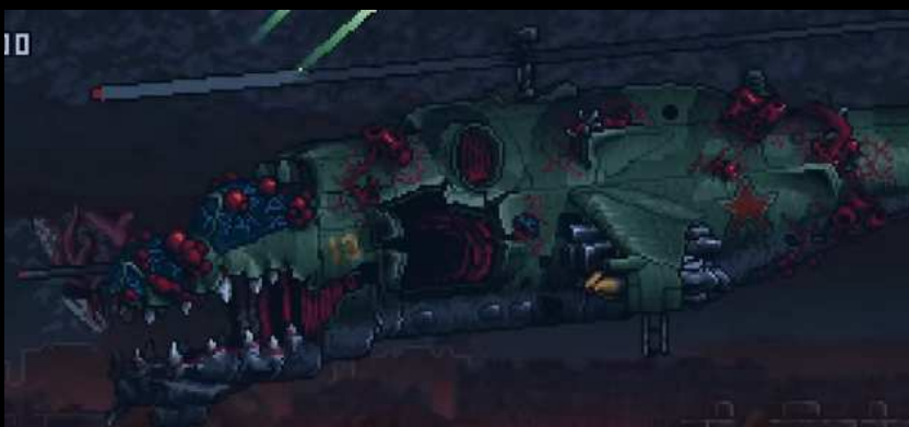
MI-24, the "Crocodile"