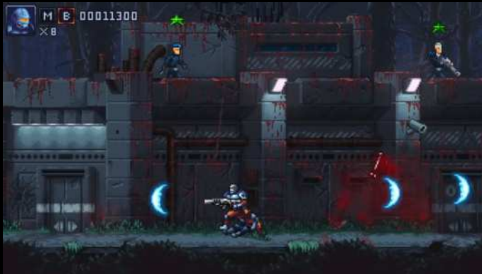
Base Building Example