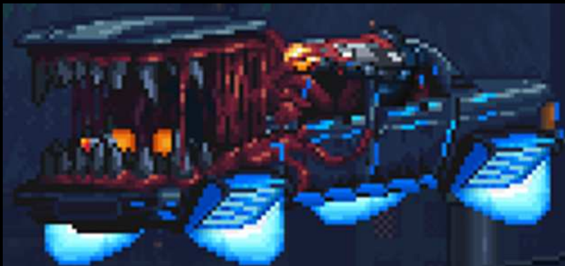
Meatified Hover Cars