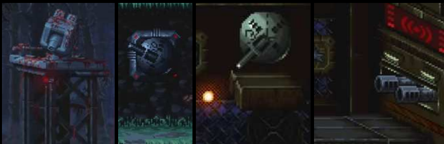
Exterior Turret Platform, Exterior Turret, Interior Turret 1, Interior Turret 2