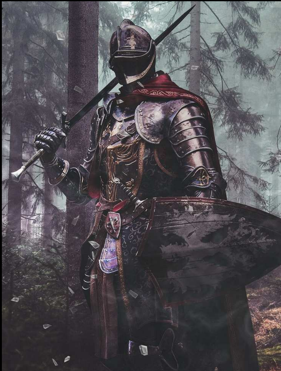
Image of the Crimson Knight

Subsequent purchases cost 100 for each new entity whose traits you'd like to use for yourself.