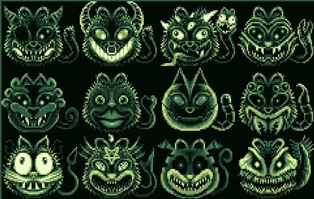
Cusffield Variants Corresponding to their respective sign

Upon death, a cusffield will explode into approximately 200 pounds of high quality frozen lasagna. Additionally, should you win this gauntlet, you have the option to keep a less annoying version of Cusffield as a pet. Either the Cusffield equivalent of your defeated Goreffield, or the one of your cusp sign.