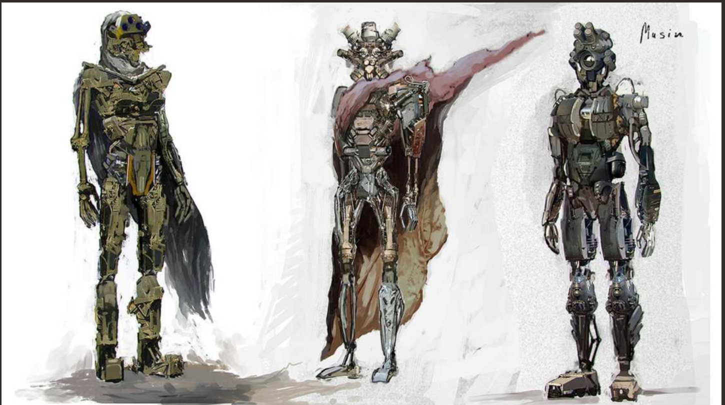
Skeletons come in all kinds of models and varieties

Skeletons are naturally much more durable than other races, due to their fully metal composition. When damaged however, they don't heal naturally and need to be repaired with special repair kits. They do not need to eat.