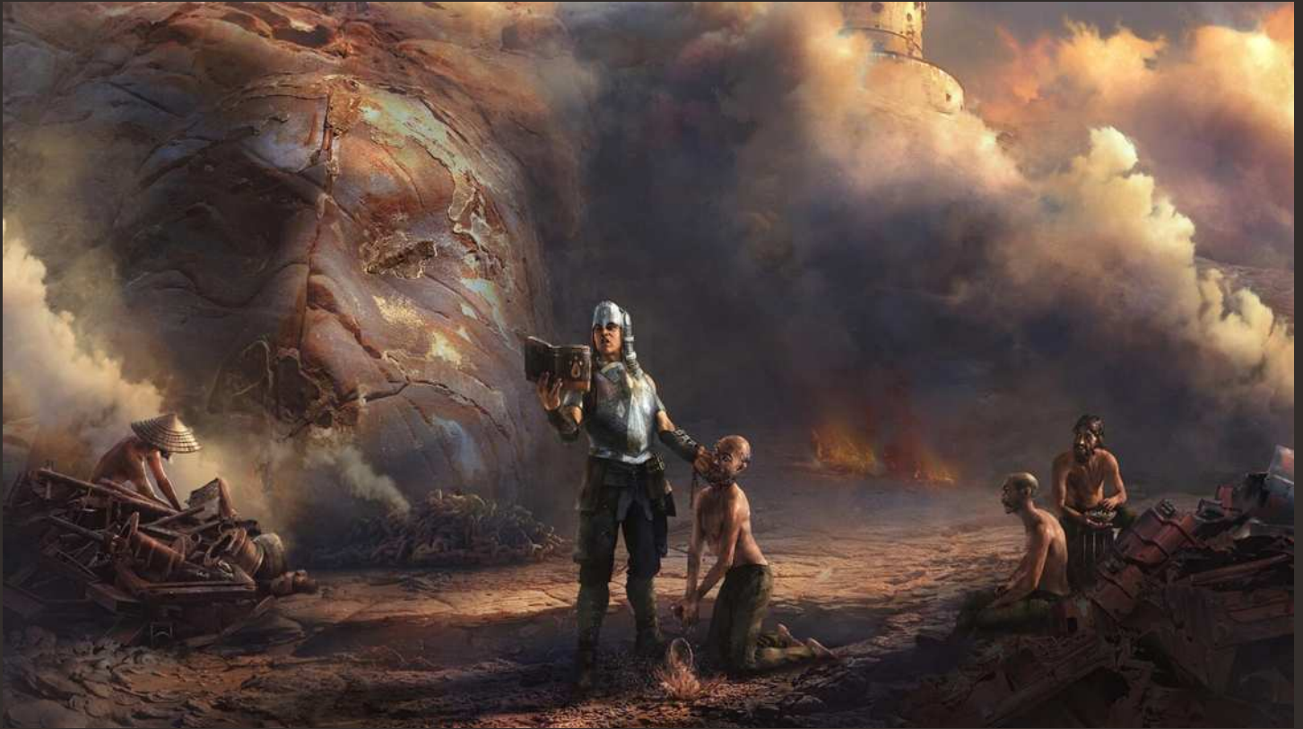
A Holy Nation Paladin educating a slave