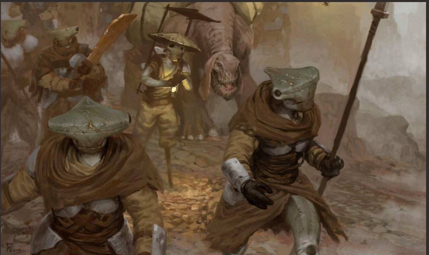
A Hiver trade caravan, guarded by Hive Soldier Drones

Mercenary - Your most prized possession is your blade, and you sell your skill to others to make a living.