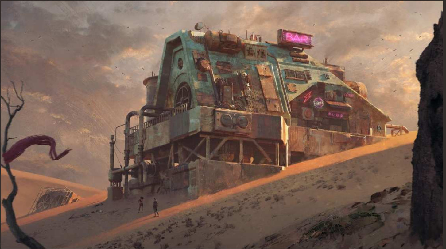
Bars are popular places to rest and hire mercenaries