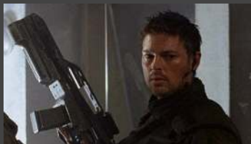
Reaper - 100CP

He's a little unbalanced, with psychopathic tendencies. Still, he's a damn good soldier.