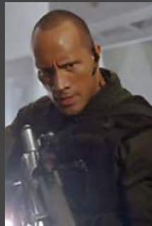
Sarge - 100CP

Beautiful, headstrong, and one hell of a scientist, Doctor Grimm has a spine of steel.